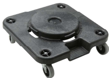
Square dollies are available to ensure easy mobility and maneuverability of heavy loads.