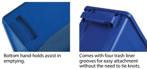
Bottom hand-holds assist in emptying.