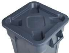
Tight fitting lids help protect the contents. Lids allow for stable stacking to save space.