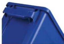
Comes with four trash liner grooves for easy attachment without the need to tie knots.