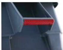
Comes with an ergonomic handle with a smooth and comfortable feeling.