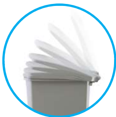
Built-in mute, prevent noise effectively.