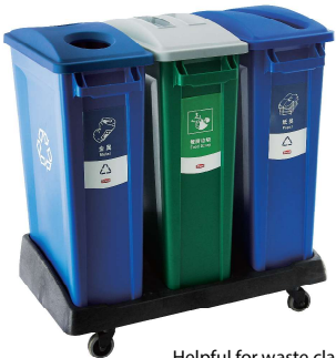
Helpful for waste classification and management.