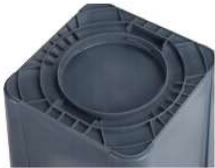
Bottom hand grips of 30 mm width assist in emptying.